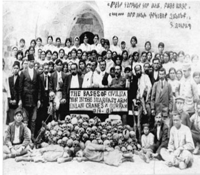
Fig 4 (k) Armenian refugees at the pyramid made from the skulls of Armenian martyrs