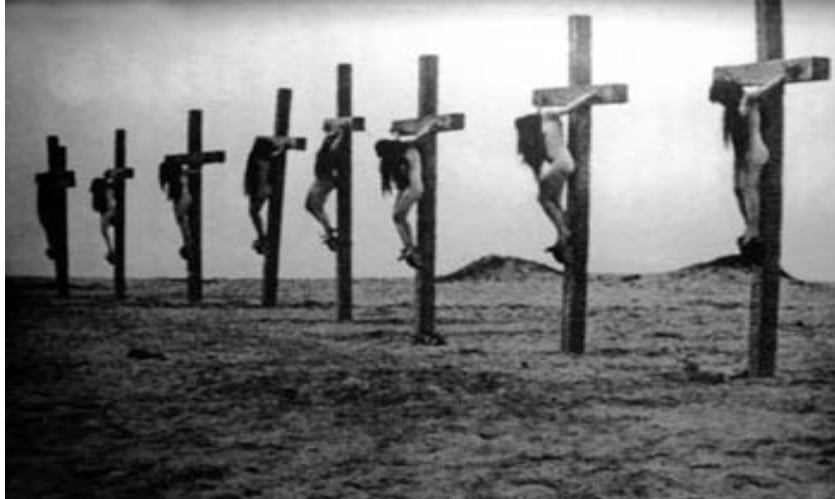
Fig. 3 (e) A line of naked, crucified Armenian girls

symbolism, the passions of Jesus Christ, the idea of martyrdom and, finally, resurrection that follows crucifixion. The aforementioned images frame discourses on that historical period. At the same time, the Christian symbolism of resurrection after crucifixion represents the rebirth of the Armenian nation and the formation of the Armenian state after the Genocide (fig. 3 (g,h)).