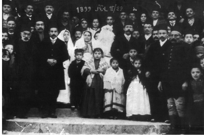
Fig. 4 (b) Armenian wedding in Tokat, Ottoman Empire, 1899