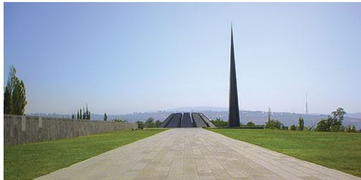
Fig. 3 (a) The Armenian Genocide Memorial-Complex in Yerevan

The discourse on the lost land is visually represented in all the monuments located in Tsitsernakaberd. In 1997, the Museum-Institute exhibited the first glass jar of soil from an Anatolian vilayet as a relic from the lost homeland. In a couple of years, the practice of "bringing soil back from Western Armenia" became an inseparable part of the remembrance (fig. 3 (c)). Ten years later, Armenia's land claims got their political interpretation in the discussed Armenian-Turkish protocols 19 .