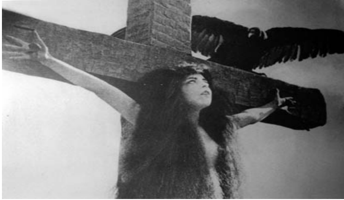
Fig. 4 (i) A typical exploitative shot