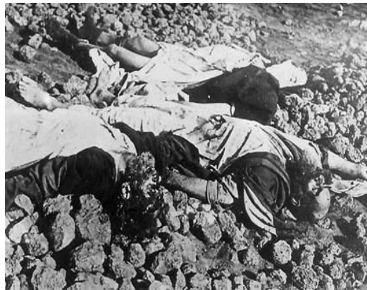
Fig. 4 (h) Tortured and killed Armenian clergymen

Finally, the discourses on the "survival", "rebirth" and "revival" find their symbolic representations in the photographs of the Genocide survivors and refugees. Death and human loss are always persistent in these photos, creating binary representations of the survivors and the victims (fig. 4(k)) as an ahistorical memory of the Armenian loss.