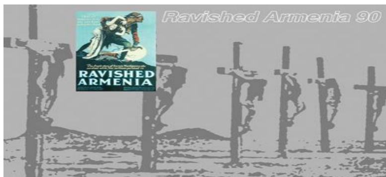
Fig. 3 (g) Postcard issued on the occasion of the 90 th anniversary of the screening of Ravished Armenia