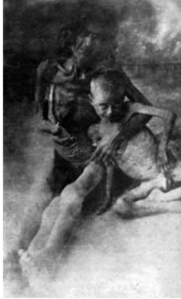
Fig. 4 (g) Starved Armenian woman with her son in Syrian desert, 1916