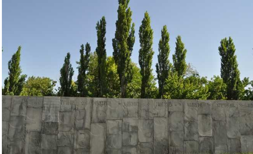
Fig. 3 (d) The Armenian Genocide Memorial Wall in Tsitsernakaberd, Yerevan

Let's analyze, for example, one of the exhibits of AGMI's Permanent Exhibition - the illustrations and photos of Arshaluys (Aurora) Mardiganian's documentary memoir "Ravished Armenia" 20 . The choice of the documentary itself frames a specific category which the state is using repetitively in producing discourses on the Genocide-torn Armenian nation. What is most important here is the poster of the documentary entitled "Auction of Souls" and the photo of crucified Armenian girls (fig. 3 (e,f)).