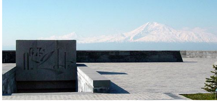
Fig. 3 (b) The entrance to the Armenian Genocide Museum-Institute in Yerevan