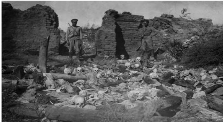
Fig. 4 (e) Armenians burnt alive in Sheykhan by Turkish Soldiers, 1915

Finally, the last category that I analyze in Chapter 4.2 is the representations of dead bodies in the AGMI permanent exhibition. The aim is to find a nexus between the 'situatedness' of the images of dead bodies and the specific knowledge they produce on the Armenian Genocide.