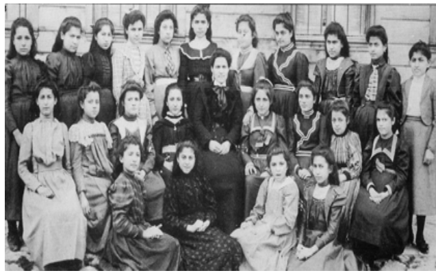
Fig. 4 (c) Female college, Adabazar, 1900