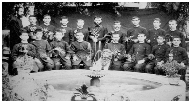
Fig. 4 (d) The graduates of monastic school, Ardashir, 1899-1900