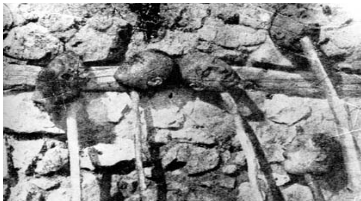
Fig. 4 (f) Beheaded Armenians