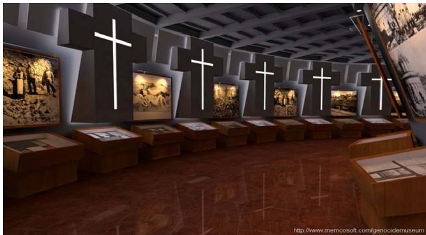
Fig. 4 (a) The Permanent Exhibition hall of AGMI

The marble and basalt-carved walls of the AGMI permanent exhibition halls generate a panorama of black-and-white photographs illustrating the death marches of Armenians in Ottoman Turkey. The exhibits take the visitors down to the memory lane, creating a sense of pandemonic solemnity. The exhibit halls resemble an early Christian tomb, and the only source of light comes through the cross-shaped windows (fig. 4 (a)). The images are exhibited along with relics and textual materials collected from all the vilayets of Anatolia.