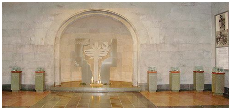
Fig. 3 (c) The third exhibit hall of the Armenian Genocide Museum with soil glasses from all the 12 Anatolian vilayets