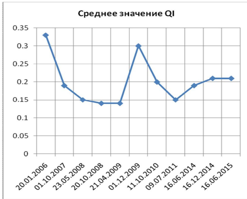
Chart 2. QI of leading commercial organizations in Russia