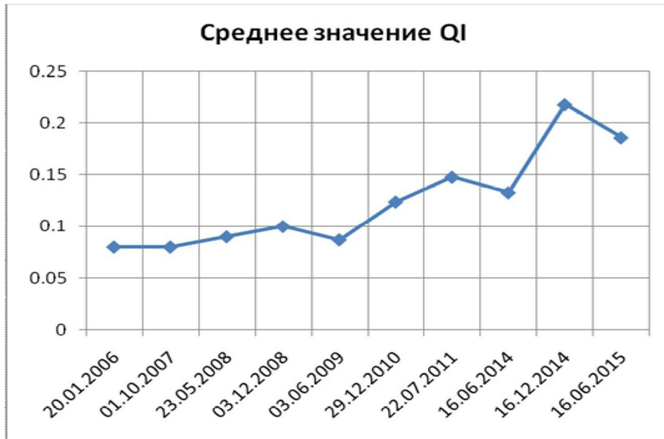
Chart 3. QI of Innovation Centre Network in Russia

development of separate fields of education and research, development of innovation, ecology-based technologies, as well as project funding to support small business. ( http://vz.ru/news/2015/7/22/757430.html ).